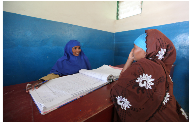
The Women and Children police desk in Hargeisa, Somaliland. With UNDP's support, this unit and others like it ensure that the particular needs of women and juveniles coming into contact with the law are appropriately addressed.

In 2008, UNDP created the Global Programme for Strengthening the Rule of Law in Conflict and Post-Conflict Situations ( Global Rule of Law Programme ).